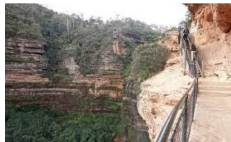
Steps down at Wentworth Falls