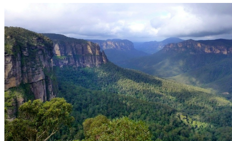
Amazing views in the Blue Mountains