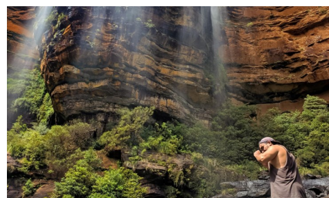
Wentworth Falls from below