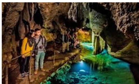
The Jenolan Caves