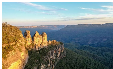
3 sisters from viewpoint