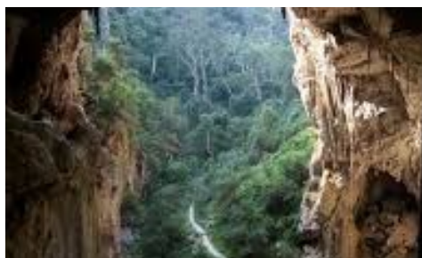
Driving to the Jenolan Caves