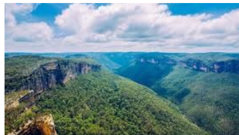
The Blue Mountains

Let us know how it went please. We hope you had a good day!