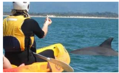
Kayak with dolphins at Byron Bay