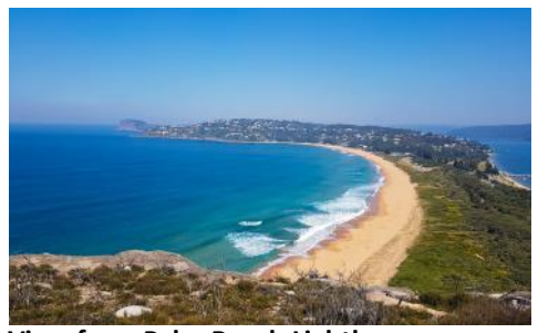
View from Palm Beach Lighthouse