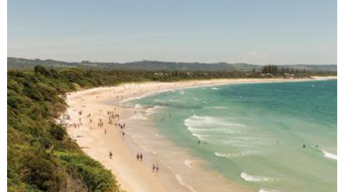
Byron Bay Main Beach