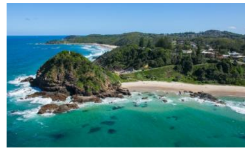
Port Macquarie Beach