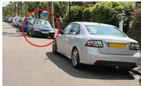
Park Same Direction as Others