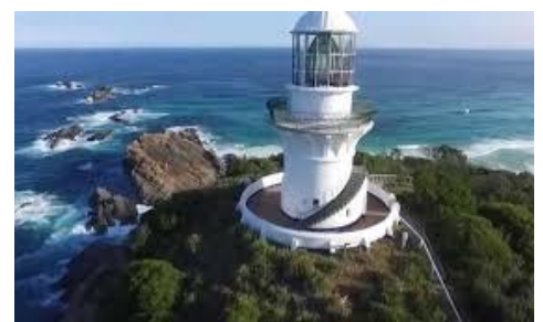
Seal Rocks Lighthouse