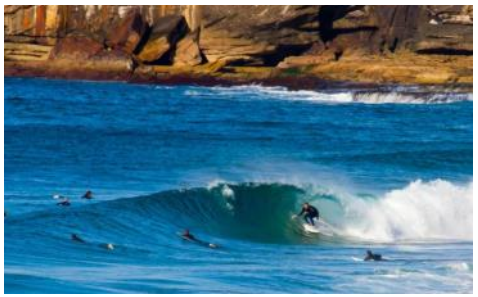
Surfing Curl Curl