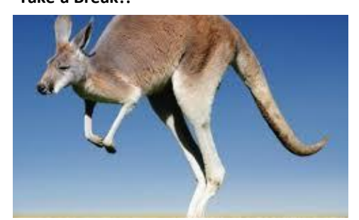
Kangaroo v Car. Kangaroo will win!!