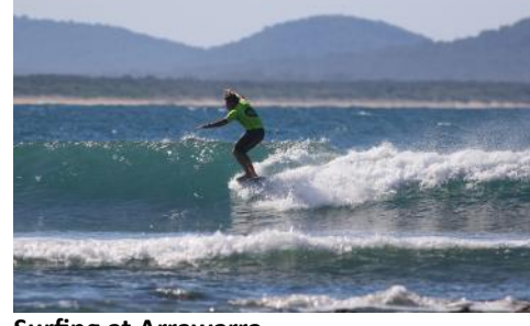
Surfing at Arrawarra

You must visit SEAL ROCKS where you will find SUGARLOAF POINT LIGHTHOUSE. This one is simply the best of all. The views are awesome. A short walk will reveal some impressive caves, beaches and the light house. Fabulous views. Don't miss it!!