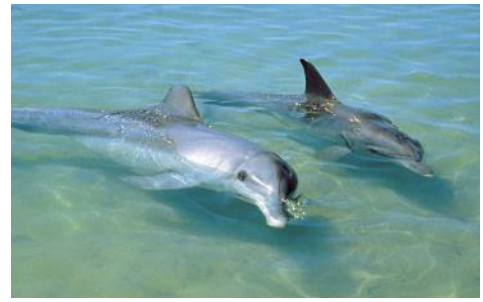
Dolphins at Port Stephens