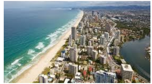
The Gold Coast

The PACIFIC HIGHWAY now gets boring going inland to the town of GRAFTON (nothing here, keep going!) and back to the coast to YAMBA which is a good place to stop as it has good surf beaches.