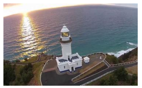
Byron Bay Lighthouse