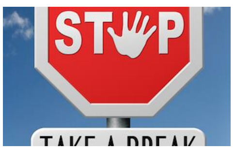
Take a Break!!