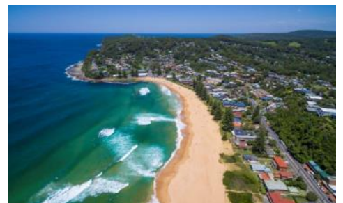
Avoca Beach on Central Coast