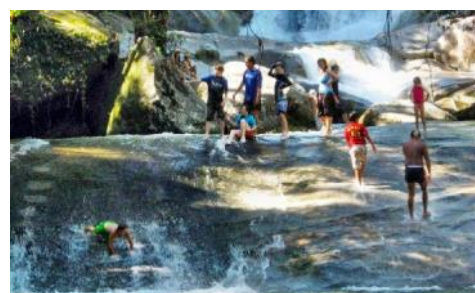
Josephine Falls at Babinda