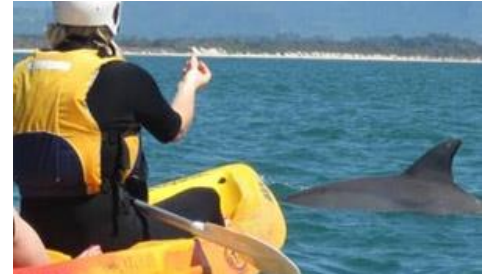
Kayak with dolphins at Byron Bay