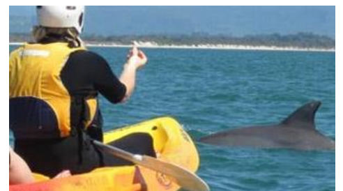
Kayak with dolphins at Byron Bay