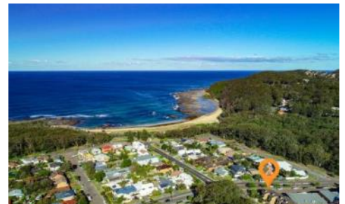
Bateau Bay on the Central Coast