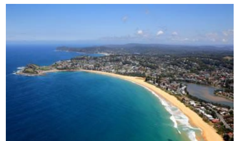
Terrigal Beach on the Central Coast