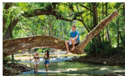
Daintree National Park