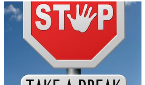
Take a Break!!