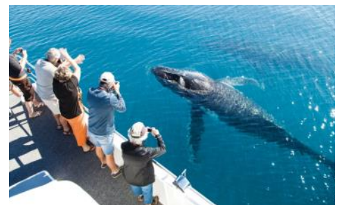
Whale Watching at Hervey Bay