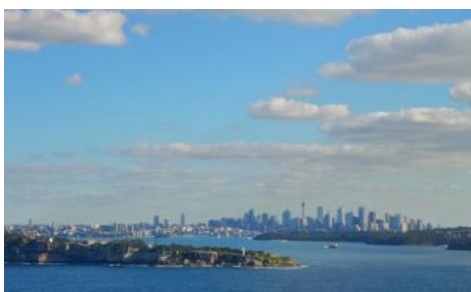
View from North Head of Sydney Har-