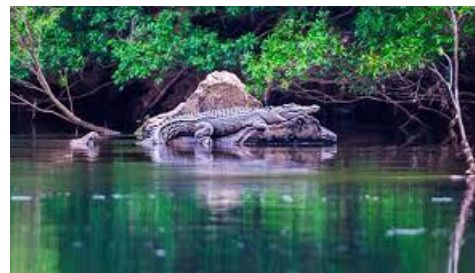
Daintree National Park Crocs!