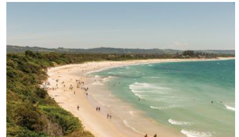
Byron Bay Main Beach