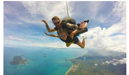
Skydive Mission Beach