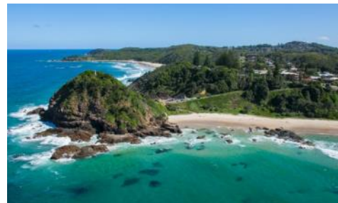
Beach at Port Macquarie