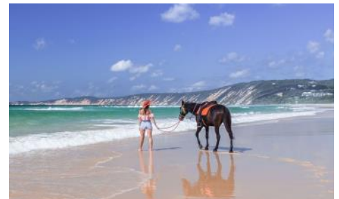
Ride Horses on the beach at Rainbow