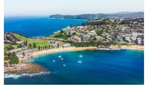
Central Coast Beaches