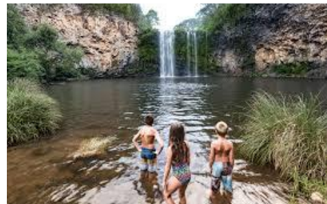
Dangar Falls on Waterfall Way