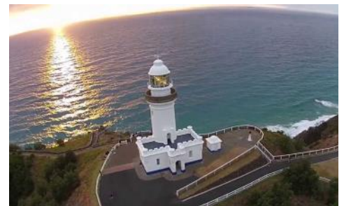
Byron Bay Lighthouse