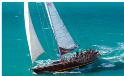
Sailing the Whitsundays