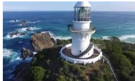
Sugarloaf Point Lighthouse at Seal Rocks