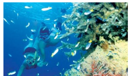
Snorkelling & Diving at the Whitsundays