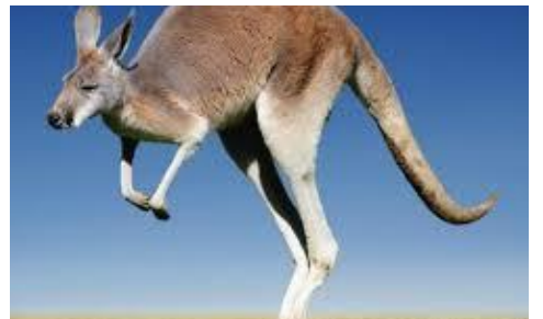
Kangaroo v Car. Kangaroo will win!!