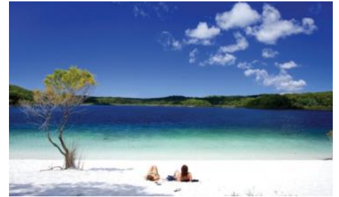
Lake Mackenzie on Fraser Island