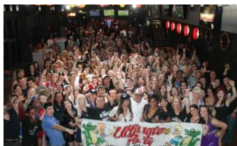
Cairns Party Bus