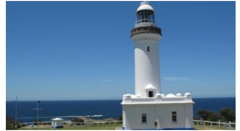
Norah Head Lighthouse