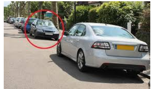
Park Same Direction as Others