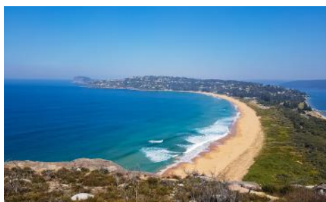
View from Palm Beach Lighthouse