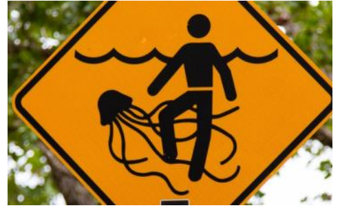
Read signs that save

Have a great trip, drive safe & Thank you!!