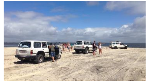
4WD on Fraser Island

After the BRISBANE comes THE GOLD COAST. This is a tourist mecca with lots of high rise tourist apartments, long surf beaches that go on for ever and the home to some iconic places such as SURFERS PARADISE, BROADBEACH & BURLEIGH HEADS all good surf spots. Lots of theme parks such as WET & WILD and MOVIE WORLD etc. The Q1 building for stunning views. Enjoy!