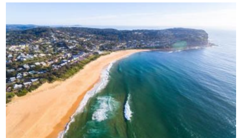
Copacabana Beach on the Central Coast