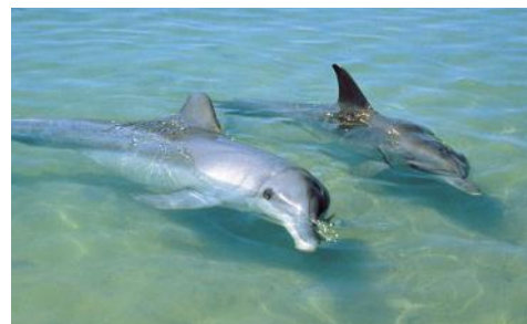
Dolphins at Port Stephens