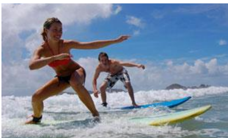
Surf/Surf lessons Byron Bay