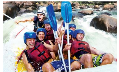
White Water Rafting at Mission Beach