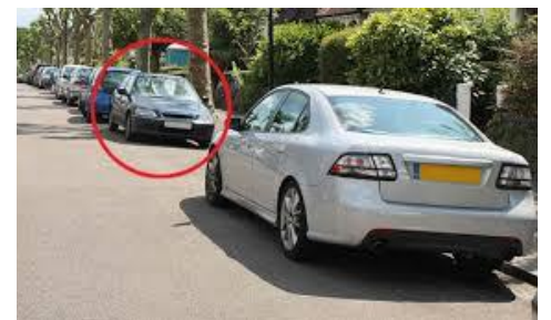
Park Same Direction as Others