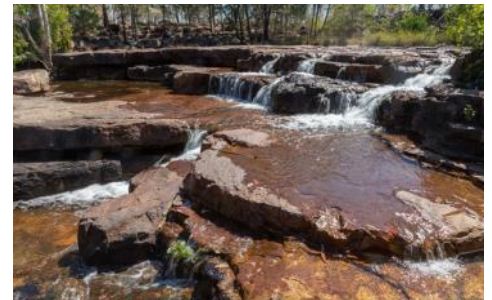
Table Top Track