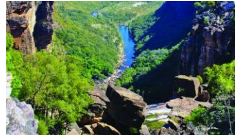
Barrk Marlam Walk