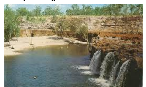
Red Falls at Charters Towers