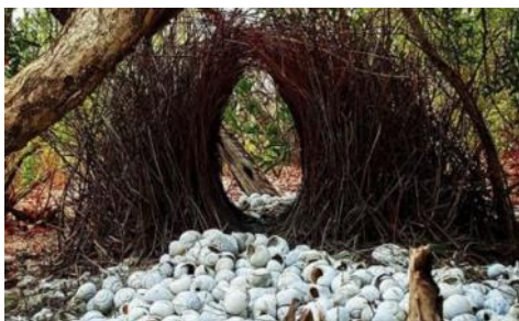
Bower Bird Nest Elsey National Park