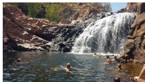
Edith Falls Swimming Hole

The early days of Mataranka were captured in the Australian novel " We of the Never Never ".