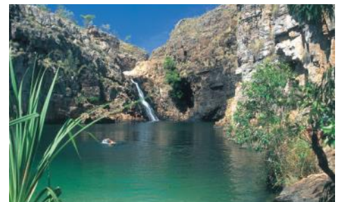
Gunlop Plunge Pool