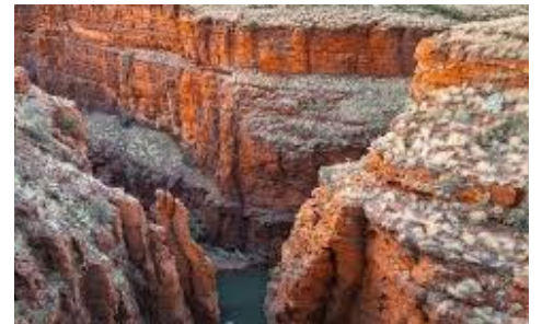
Stunning all the way