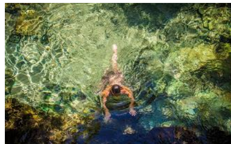
Katherine Hot Springs