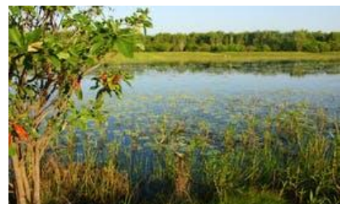
Bubba Wetlands Walk