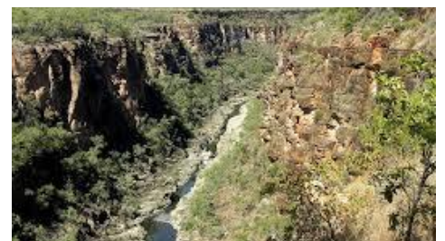
Porcupine Gorge Lookout