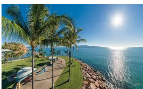
Finally the Ocean!!!