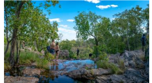
Green Ant Creek Walk