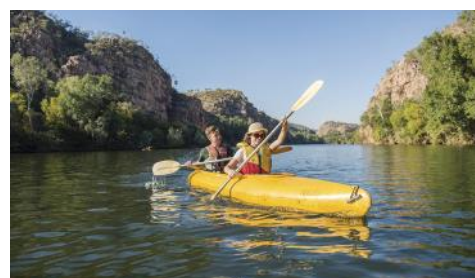
Katherine Gorge Kayaking