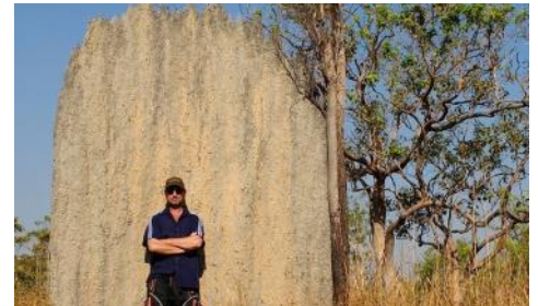
Magnetic Termite Mounds