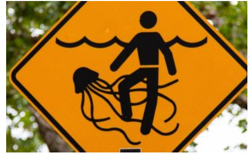
Read signs that save

Many towns make you park with back of car to the kerb whilst other towns want you to park with the front of your car to the kerb. Read the signs or get a ticket.