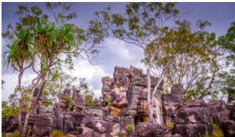
The Lost City