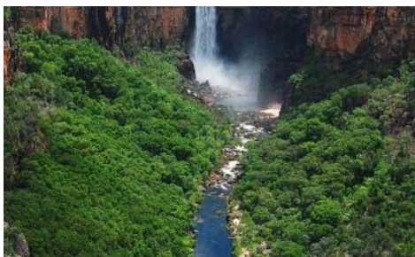
Jim Jim Falls