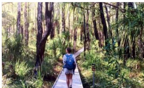
Elsey National Park Walks