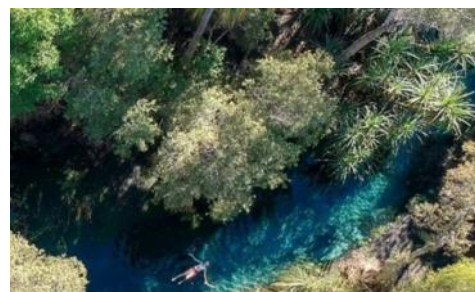
Bitter Springs Thermal Pool