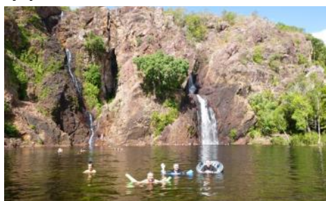
Wangi Falls Walk