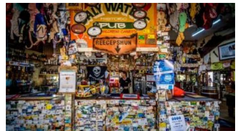
Daly Waters Pub

From TOWNSVILLE turn north for CAIRNS or south towards AIRLIE BEACH, FRASER ISLAND, NOOSA, BRISBANE or NEW SOUTH WALES.