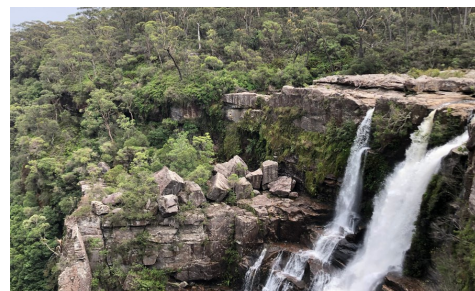
Carrington Falls from above