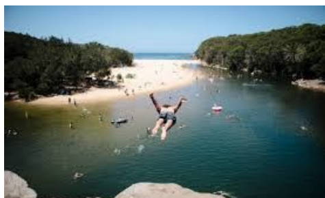
Wattamolla Beach in Royal National Park