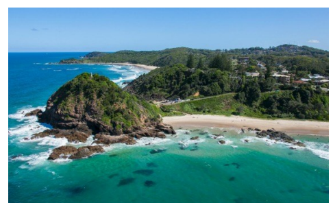
Beach at Port Macquarie