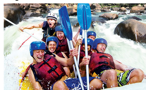
White Water Rafting at Mission Beach