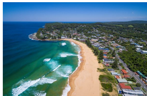
Avoca Beach on the Central Coast