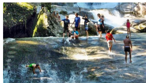
Josephine Falls at Babinda