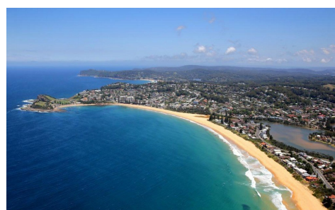
Terrigal Beach on the Central Coast