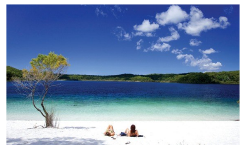
Lake Mackenzie on Fraser Island