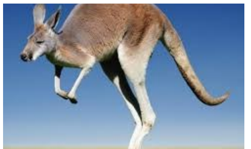
Kangaroo v Car. Kangaroo will win!!