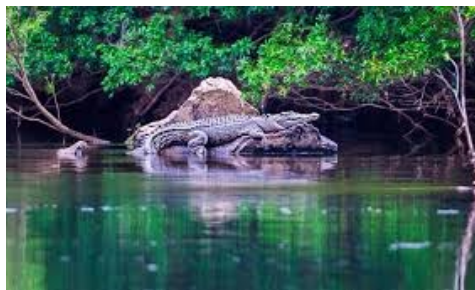
Daintree National Park Crocs!