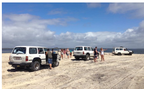
4WD on Fraser Island