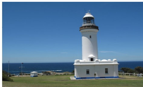
Norah Head Lighthouse on Central Coast