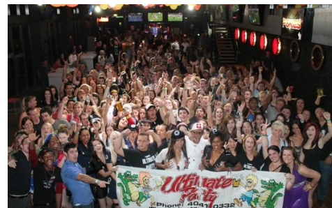
Cairns Party Bus