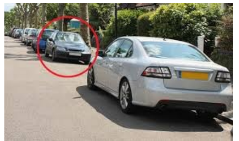
Park Same Direction as Others