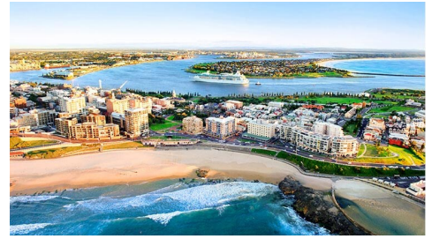
Newcastle surf beaches

COFFS HARBOUR has lots to do. You can stay here in one of many backpackers hostels. You can dive, surf, visit wildlife parks and of course the BIG BANANA (Google it)