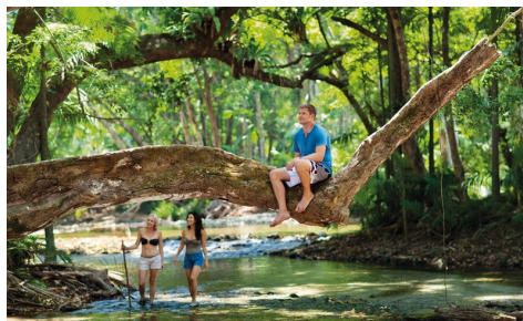
Daintree National Park