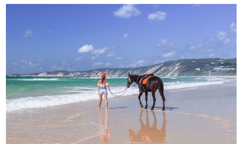
Ride Horses on the beach at Rainbow Beach