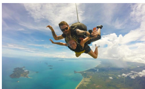
Skydive Mission Beach