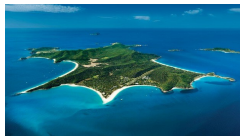
Great Keppell Island

Next place as you drive North is MISSION BEACH. Great beach, chilled out place where skydiving and white water rafting are the main attractions and well worth doing. Great backpackers hostels here too