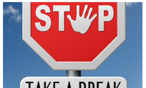
Take a Break!!