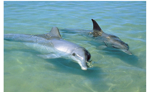
Dolphins at Port Stephens