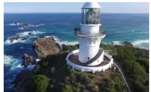
Sugarloaf Point Lighthouse at Seal Rocks