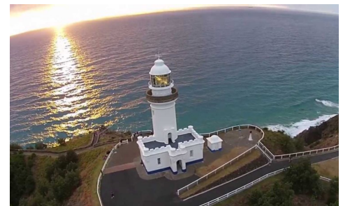
Byron Bay Lighthouse