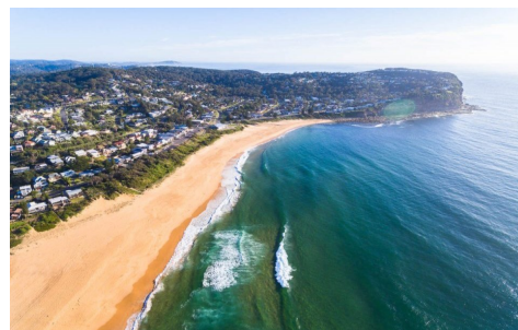
Copacabana Beach on the Central Coast