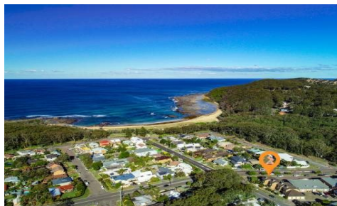
Bateau Bay on the Central Coast