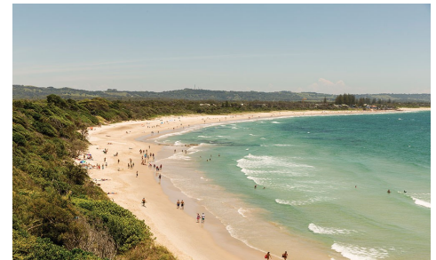
Byron Bay Main Beach