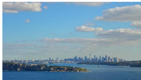
View from North Head of Sydney Harbour

You will notice on your map you can re-join the faster but boring PACIFIC HIGHWAY at several points on the coast road.