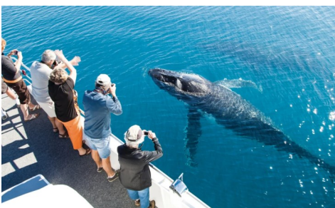
Whale Watching at Hervey Bay