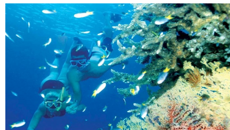
Dive and/or Snorkel Whitsundays