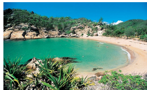
Magnetic Island off Townsville