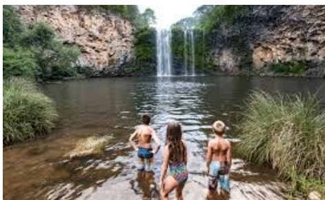
Waterfall Way—Dangar Falls