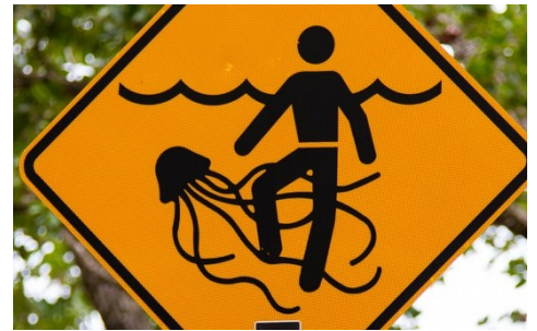
Read signs that save

Many towns make you park with back of car to the kerb whilst other towns want you to park with the front of your car to the kerb. Read the signs or get a ticket. Byron Bay especially!!