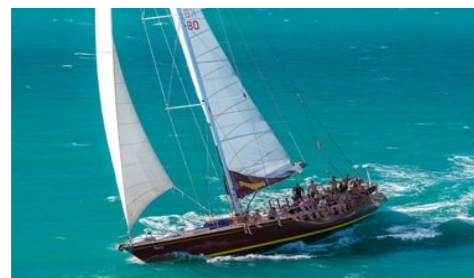
Sailing the Whitsunday Islands