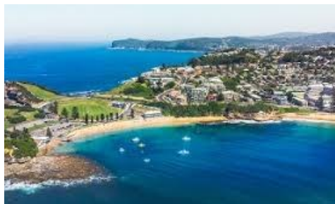
Central Coast Beaches