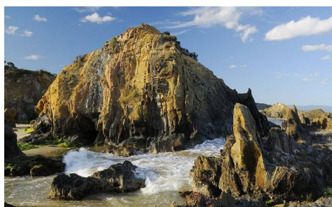
Secret Beach At Mallacoota