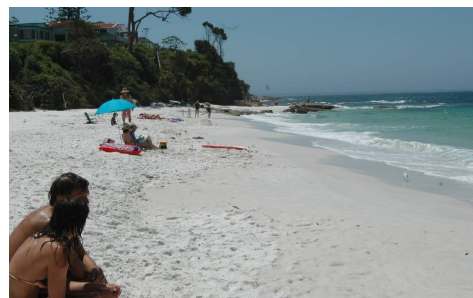
Hyams Beach At Jervis Bay