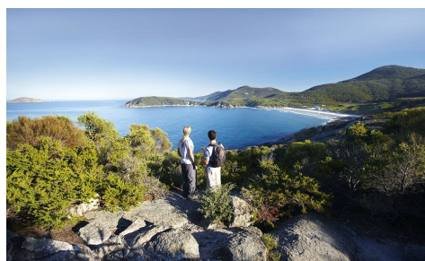
This shits sells itself!!