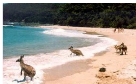
Kangaroos at Bawley Point