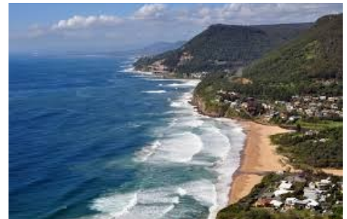
View from Stanwell Tops Lookout