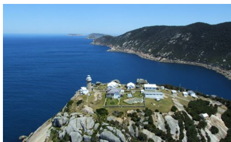
Lighthouse at 'The Prom'