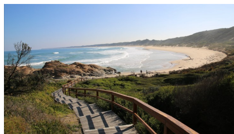
Cape Conran Nature Trail

There are backpacker hostels at FOSTER and multiple camp sites in the NATIONAL PARK itself. Enjoy!