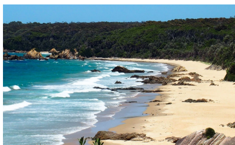
Quarry Beach At Mallacoota