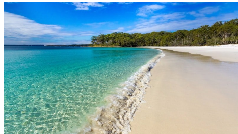
Green Patch Beach at Jervis Bay

These guys do tours of the MONTAGUE ISLAND where you can walk the island & see penguins, whales & even snorkel with seals. As far as I know this is the only place you can snorkel with seals. Take the opportunity !!