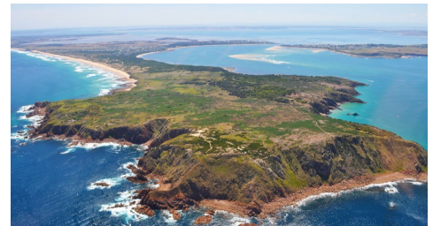
Phillip Island from Above