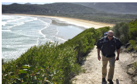
Bushwalking at 'The Prom'