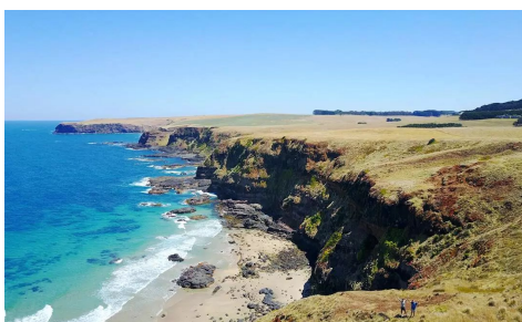
Walking Tracks at Mornington Peninsula