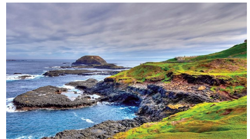
Walking tracks at Phillip Island