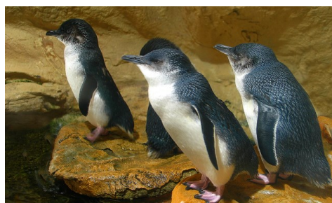
Penguins at Montague Island