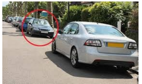
Park Same Direction as Others