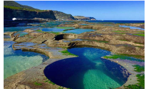
Figure 8 Pools at The Royal National Park