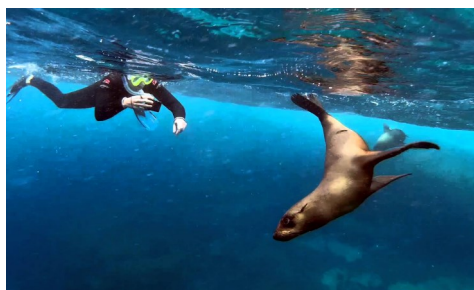
Snorkel with Seals at Montague Island