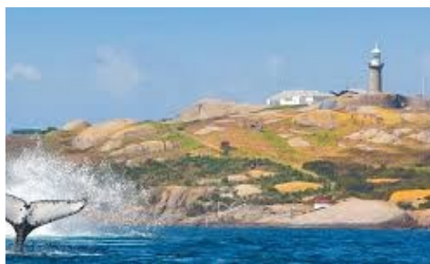
Whales of Montague Island