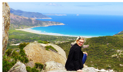
Wilson's Promontory National Park