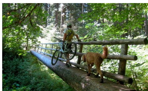
Mackenzie River Rainforest Walk