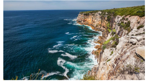
Royal National Park

Driving further south on the PRINCES HIGHWAY you will go through the town of BERRY. You can turn off here, drive through KANGAROO VALLEY and follow signs to FITZROY FALLS which are awesome. Very large and very popular.