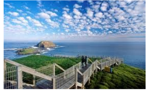
Walking tracks at Phillip Island