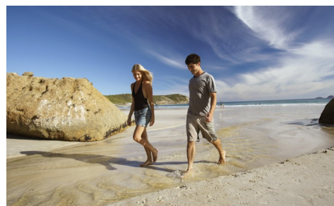
Squeaky Beach at 'The Prom'