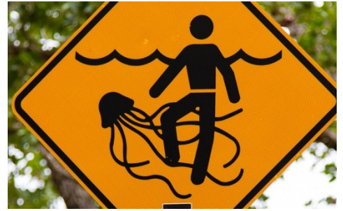
Read signs that save

Many towns make you park with back of car to the kerb whilst other towns want you to park with the front of your car to the kerb. Read the signs or get a ticket.