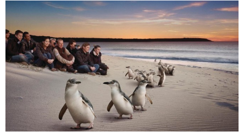
Penguins at Phillip Island