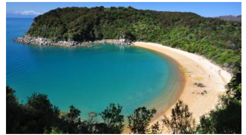
Abel Tasman National Park

A way more economical option is to purchase an 8 week pass for approx. $70.00 dollars, which will cover up to 8 people for all national parks on the whole island! That's way better value for money. You can buy this online through Parks & Wildlife Service prior to your travels.