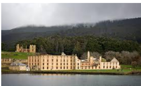
Port Arthur Prison