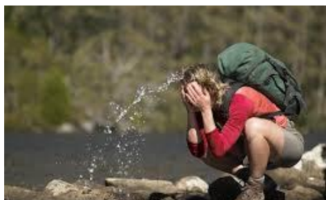
Douglas Apsley National Park