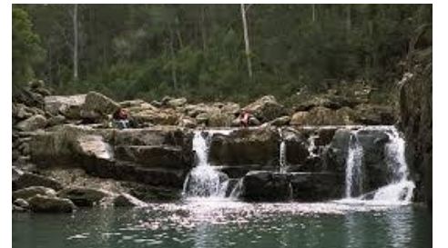
Douglas Apsley National Park