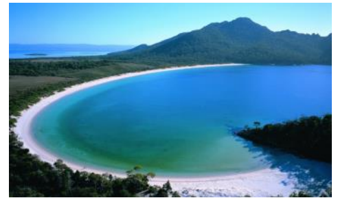
Freycinet National Park