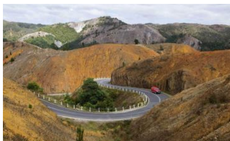
Driving out of Cradle Mountain