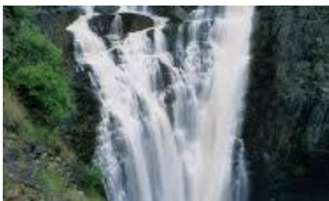
Douglas Apsley National Park