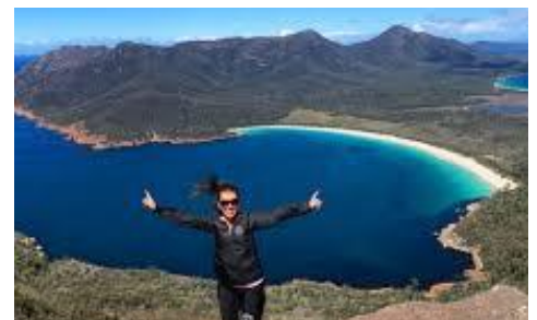
Mount Amos Hike