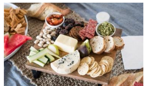
Tamar Valley Wine Trail