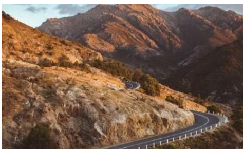
Driving out of Cradle Mountain