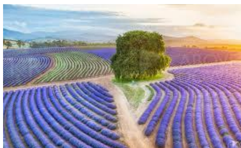
Bridstowe Lavender Estates