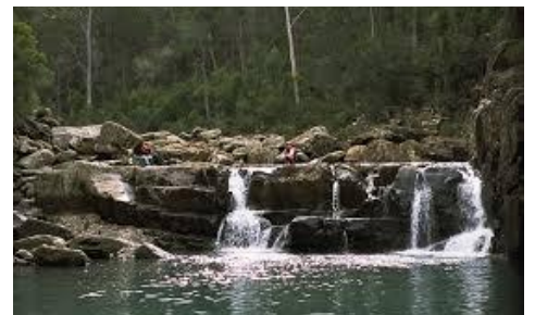
Douglas Apsley National Park