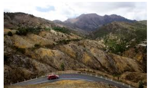
Driving out of Cradle Mountain