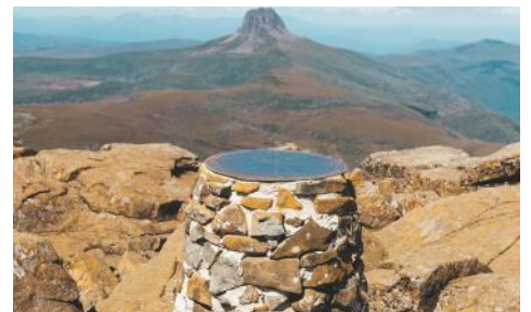
Cradle Mountain Summit