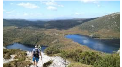
Marion's Lookout track

Though Parks & Wildlife Tasmania recommend doing it clockwise, my advice would be to go anticlockwise. It is a bit easier that way. Your first stop will be the famous BOAT SHED where photographers from all over the world swarm to capture this famous scene.