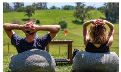
Tamar Valley Wine Trail