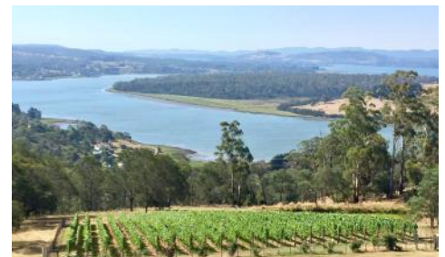
Tamar Valley Wine Trail