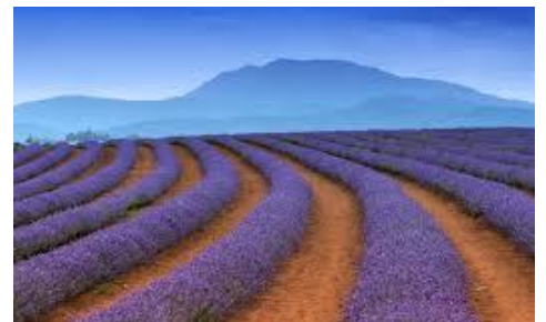
Bridstowe Lavender Estates