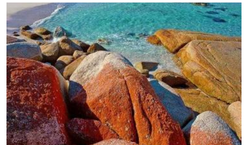
Bay Of Fires