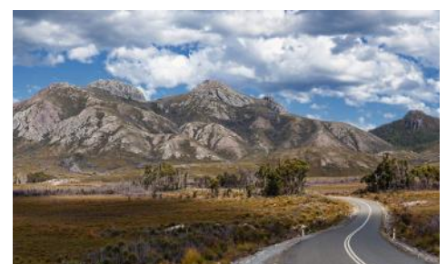
On the road