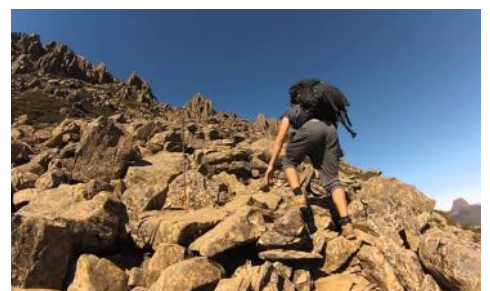
Cradle Mountain Summit