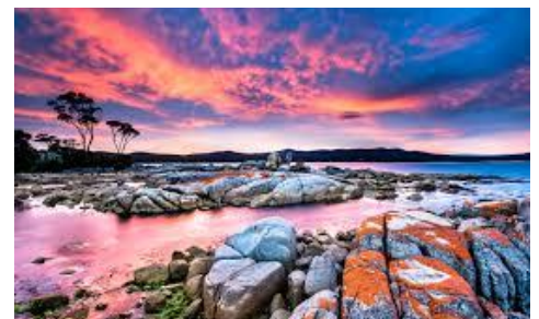
Bay Of Fires