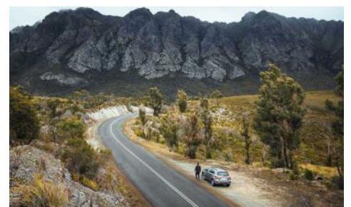
Driving out of Cradle Mountain