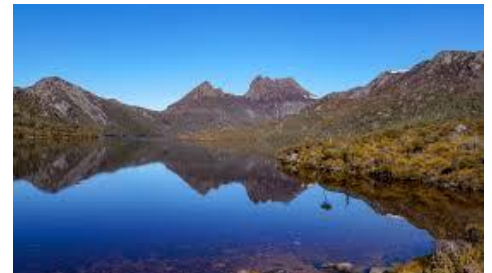
Cradle Mountain Summer