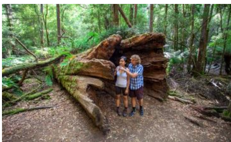
Horseshoe Falls Track