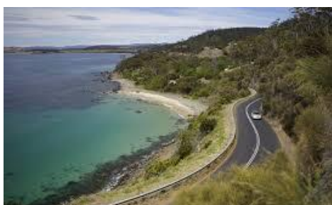
On the road