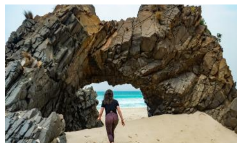
Bruny Island Cape Queen Elizabeth