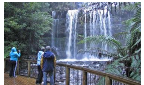
Mount Field National Park Russel Falls