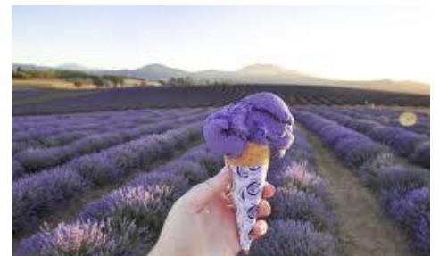
Bridstowe Lavender Estates