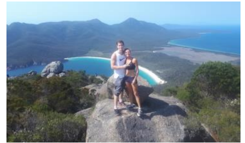
Mount Amos Hike