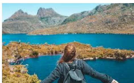
Dove Lake Circuit