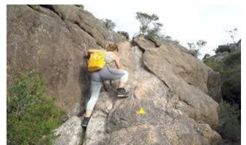
Mount Amos Hike