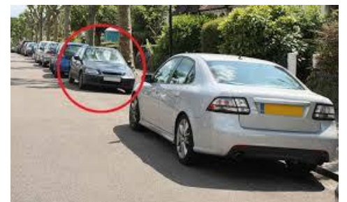
Park Same Direction as Others