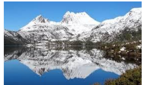
Cradle Mountain Winter