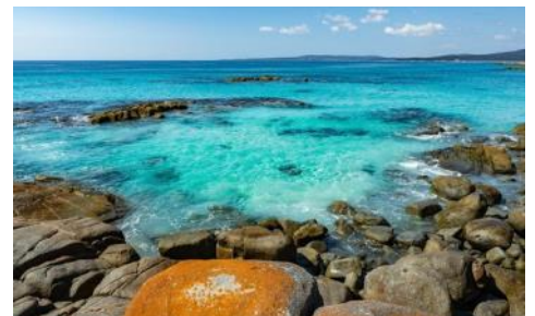
Bay Of Fires