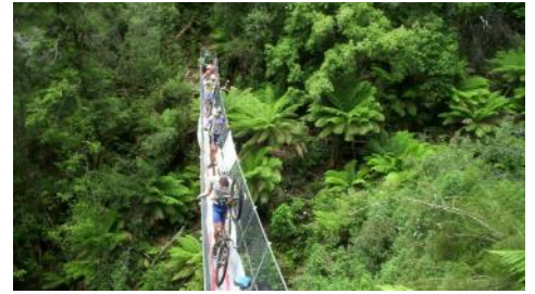
Montezuma Falls Track

The town of KETTERING is 124km south of MOUNT FIELD NATIONAL PARK. The ferry to BRUNY ISLAND leaves from here. Timetables for the ferry can be found online and the journey last approximately twenty minutes.