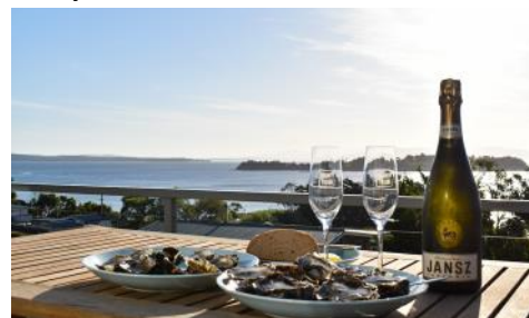
Bruny Island Food and Drink