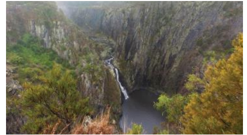
Apsley Gorge Walk

Sit down and enjoy the beach at the BINALONG BAY located at the southern tip of BAY OF FIRES. The sand here is so fine it will squeak under your feet as you walk along the shore. This is a perfect place to take a break from hiking, enjoy the beach and the sea breeze.