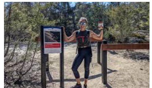
Mount Amos Hike