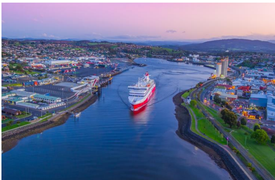
Back to finish your loop in Devonport