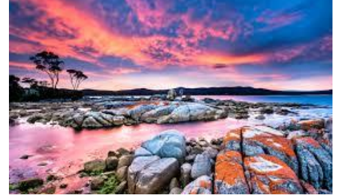
Bay Of Fires