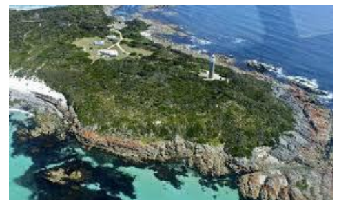
Eddystone Points & Lighthouse