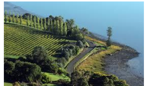
Tamar Valley Wine Trail