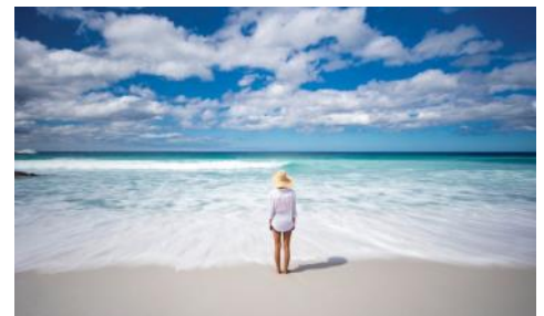
Bay Of Fires