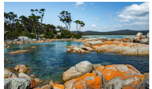
Bay Of Fires