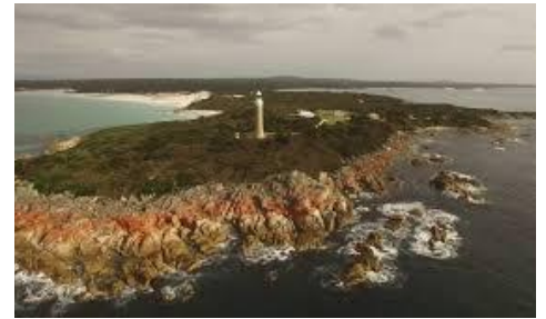
Eddystone Points & Lighthouse