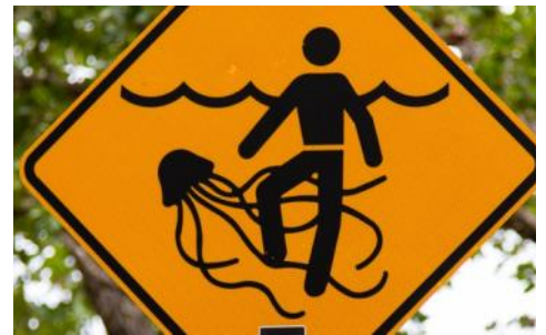
Read signs that save

Many towns make you park with back of car to the kerb whilst other towns want you to park with the front of your car to the kerb. Read the signs or get a ticket.