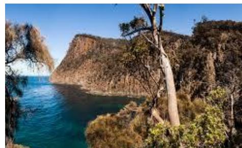
Bruny Island Fluted Cape Track