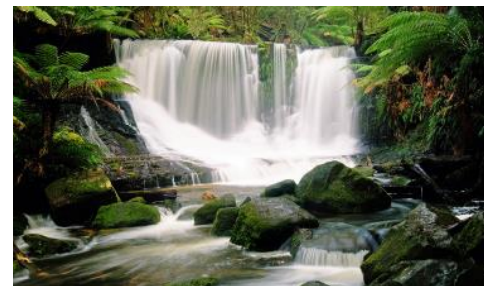
Mount Field National Park