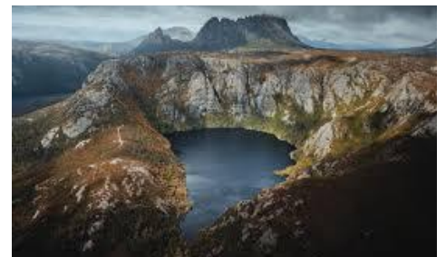
Cradle Mountain wow!