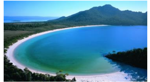
Freycinet National Park

This walk is 5.6km over 2-3 hours if you come back the way you came. Its stretches out to 7km if you return via the river. This walk starts as a gentle stroll through open woodland before reaching the surprising and lovely APSLEY WATER HOLE.