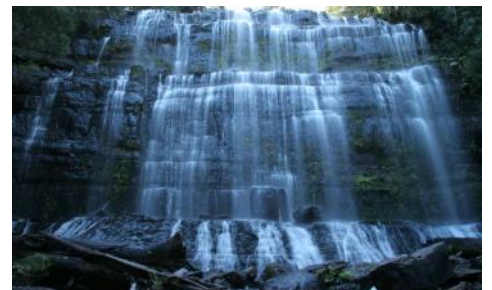
Mount Field National Park Russel Falls