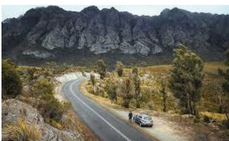
On the road