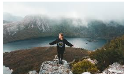
Cradle Mountain Summit